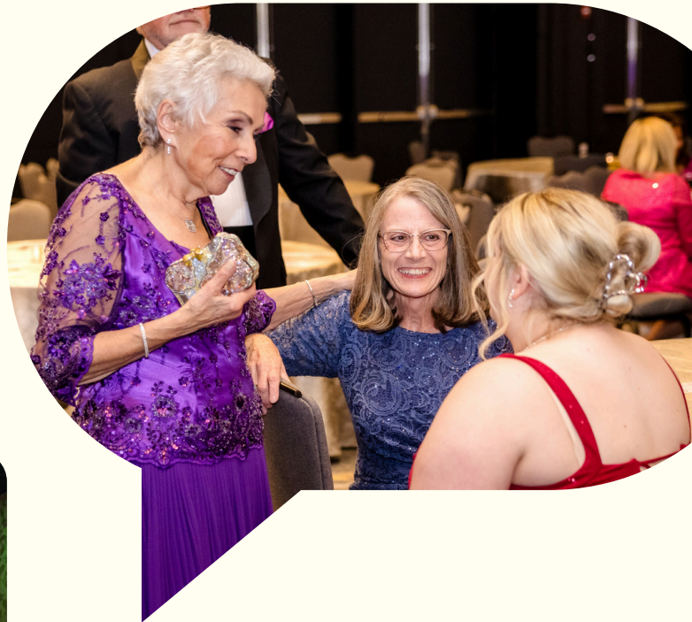
A Sterling Event