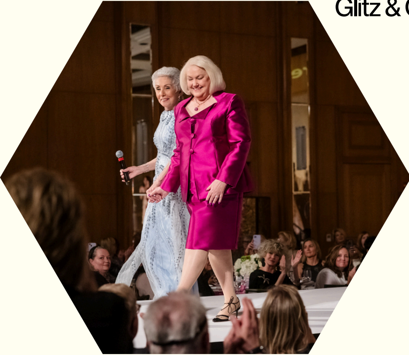
Glitz & Glamour